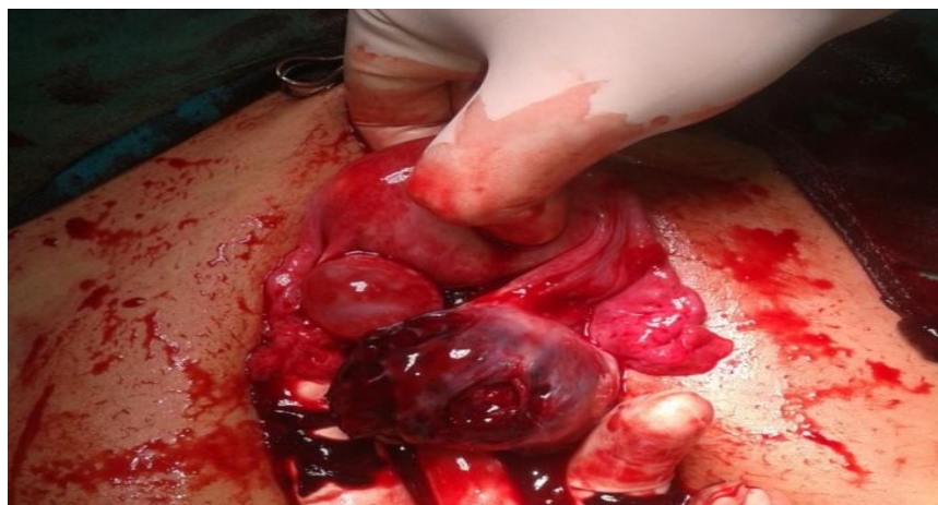
Intraoperatively: Right Ovarian Ectopic